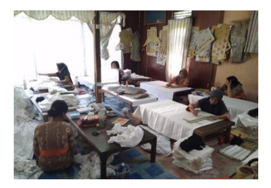
Figure 3. The activity of artisan drawing Sasirangan fabric patterns