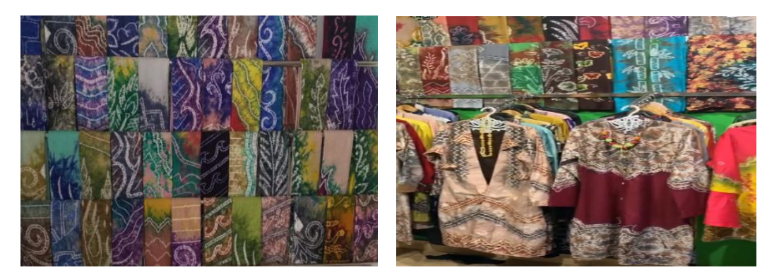
Figure 1. Patterns and product Sasirangan fabric