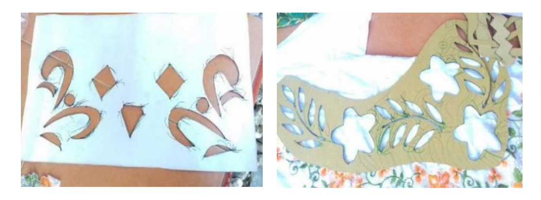
Figure 2. Sasirangan fabric patterns