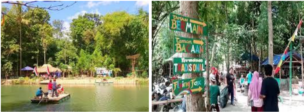
Figure 2. Tourism activities at the Glugut Park

The purpose of establishing Glugut Park Tourism is not solely for tourist attractions, but also to empower the community. Thus, it is expected that this park can bestow a good impact on the lives of the surrounding community in terms of economy, as well as social and cultural lives. In line with the purpose of the establishment of the Glugut Park Tourism, the forms of activities in the Glugut Park Tourism are adjusted so that they benefit the surrounding community. The forms of these activities include tourism, educational, economic, and socio-cultural activities.